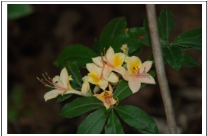
Yellow Arborens Seedling – Available from East Fork Nursery, Sevierville, TN

These were available for sale at this year's Plant Sale. Bought two – the other one bloomed white with a deep, large yellow blotch. The yellow is a bit on the pale side, but yellow nonetheless.